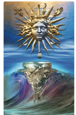
PAGE OF WATER

The Page of Earth represents a tactile, quiet child. With this energy, you must be patient—don't rush them, and give them plenty of down-time for rest. Allow them to get their hands dirty. Physical activity and outlets are essential, preferably outdoor activity, for balance and optimum emotional health. Schedules are also very helpful.