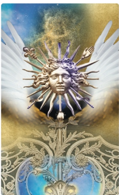
PAGE OF AIR

The Page of Water represents an emotional and sensitive child. Be mindful that this child isn't running or carrying the emotional energy for everyone around them. Relaxation is critical for them—from people to toys. Creating downtime for them to replenish and recharge is a must.