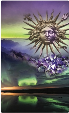
PAGE OF EARTH

The Page typically represents a very young child, person, or messenger with very youthful energy aged 0-30.