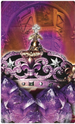
KING OF EARTH

Consider the King card a mini-Emperor. A card with Cardinal qualities, it brings the message of new beginnings, forward movement, initiation, rules, and creation.