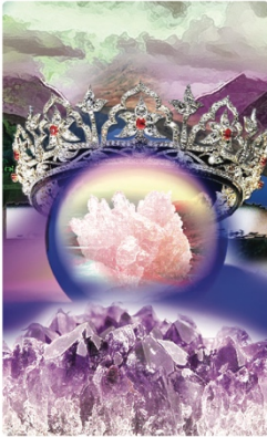
QUEEN OF EARTH

The Queen sits alongside The Empress, full of great power, wisdom, strength, and determination. With fixed astrology qualities, maintaining order, stability, structure, and balance of power are top priorities for The Queen.